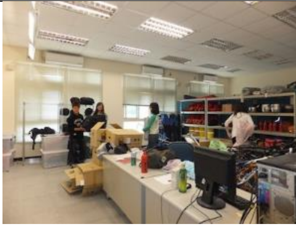
Outdoor recreation project classroom (Room B221) : Outdoor recreation equipment and equipment