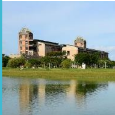
College of Indigenous Studies