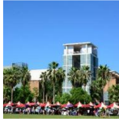
College of Science and Engineering