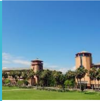
College of Humanities and Social Science