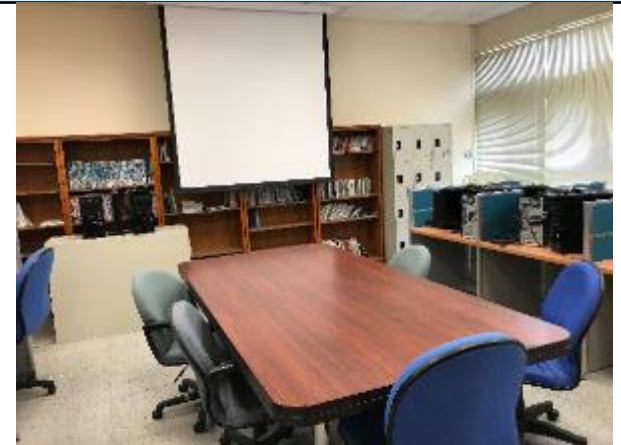
Undergraduate Student Discussion Room (Room D209) : Group discussion and reading space.