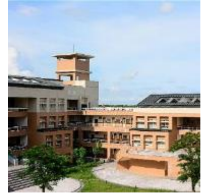
College of Management