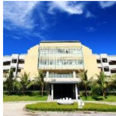
College of Environmental Studies