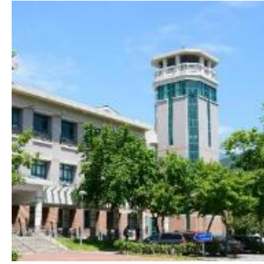
Hua-Shih College of Education