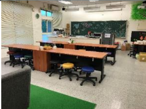
Dining and Hospitality Classroom (Room B203) : Fireplace café serves as a hands-on classroom.