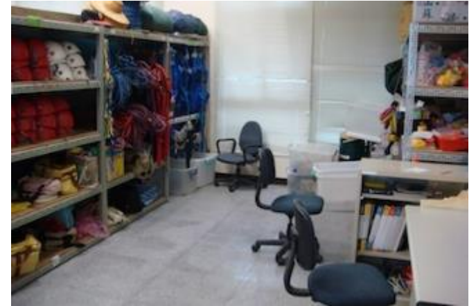
Adventure experiential project classroom (Room B225) : Adventure experiential educational facilities and equipment