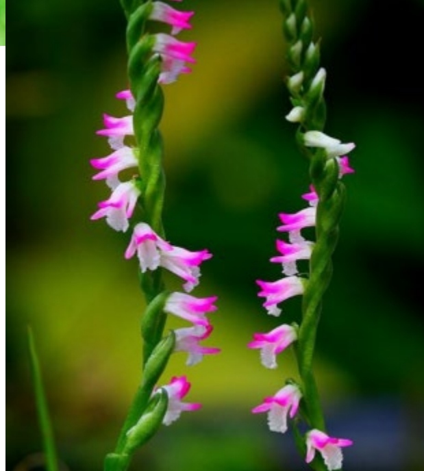
Southern Ladies Tresses