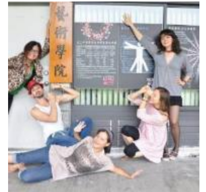
College of The Arts