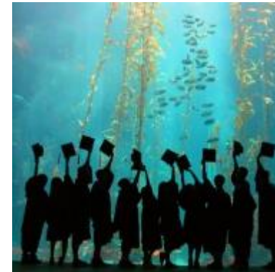
College of Marine Sciences